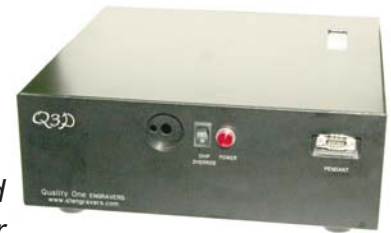
New & Improved Q3D Controller